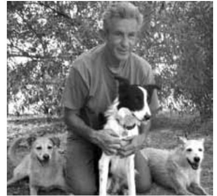
Sonic with his new family